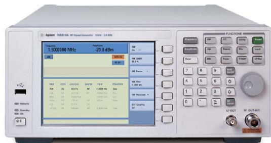
N9310A RF Signal Generator

All the capability and reliability of an Agilent instrument you need — at a price you've always wanted