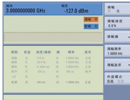
Multi-language display and instruction help ensure easy operation of your signal generator, no matter who's using it.

Optional rack mount kit enables simple stacking with other test equipment in standard test racks. The rackmounted signal generator is full width and a compact, standard 3U height.