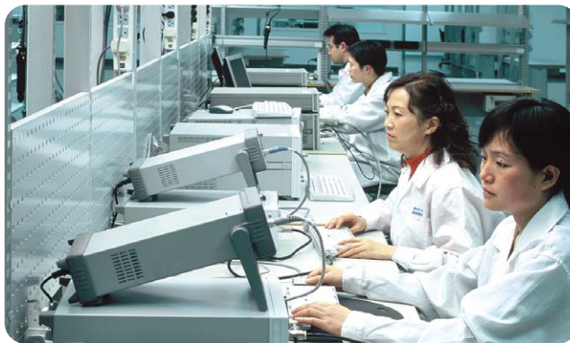
Agilent's new low-cost, compact signal generator provides a money-saving solution in high-volume manufacturing applications.

Now you know the signal generator to choose when you are ramping up your volume manufacturing. Moreover, you can be confident that the price and performance will please your management team, too.